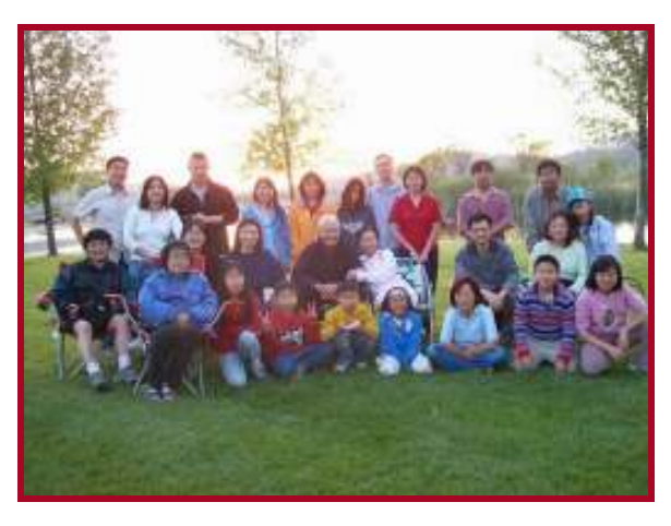
Our young writer, front row, third from left, enjoys a group photo with her camping buddies.

I figured I should give my parents a helping hand. The tents took about 20 minutes to complete. I got bored helping so my mom said I should go take a bath before the water got too cold to use.